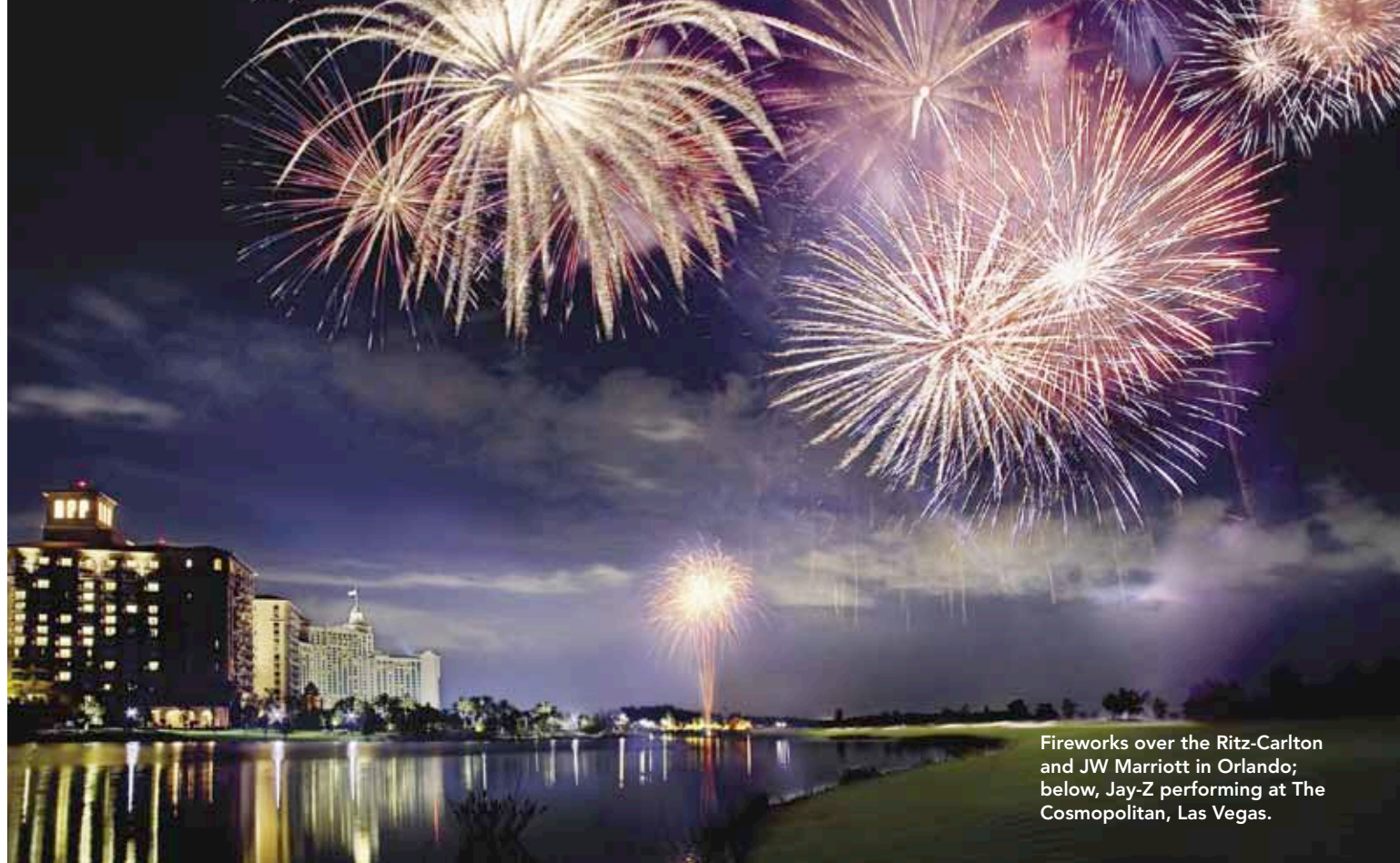
Fireworks over the Ritz-Carlton and JW Marriott in Orlando; below, Jay-Z performing at The Cosmopolitan, Las Vegas.